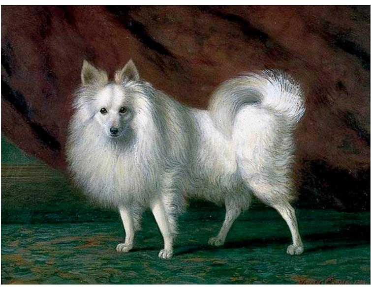
The White Dog by Vivian Crome, shortlisted for display in Woof!

The exhibition will be aimed at a family audience, with an emphasis on objects rather than text. The themes of Woof! include: