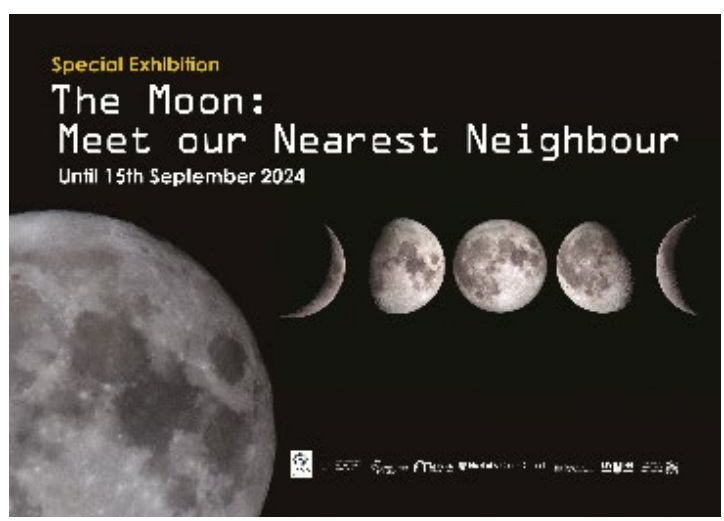
Publicity material for the Lynn Museum's current exhibition

This touring exhibition explores Earth's natural satellite – the moon. A key exhibit is a large moon model suspended above the exhibition, making use of the museum's high chapel ceilings. As part of the exhibition visitors have the opportunity to touch a real piece of moon rock. Other artefacts include ephemera from the 1969 moon landing. These displays, together with an associated programme of events and activities has been supported by a grant of £10,000 from the UK Shared Prosperity Funding for West Norfolk for arts cultural heritage and creative activities administered by the Borough Council of King's Lynn & West Norfolk.