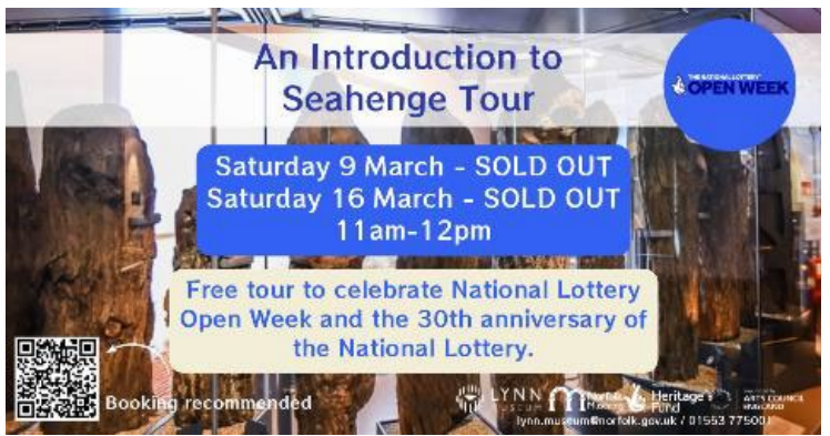
Publicity for the free Seahenge Tour offered at Lynn Museum in support of the National Lottery and as a thank you to lottery ticket holders