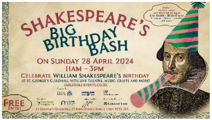
Publicity for event at St George's Guildhall supported by Norfolk Museums Service

The Lynn Museum free admission period started in October and ran until the end of March. This free admission period is provided under the terms of the Service Level Agreement (SLA) between the Borough Council and NMS.